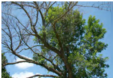
Canopy thinning or dieback

Springfield has approximately 3000 ash trees on public property and 6000-7000 on private property. Symptoms of an EAB infestation are as follows: