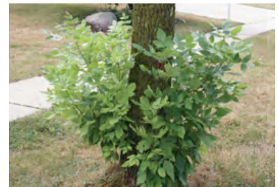
Suckers, or new growth will sprout from the trunk

For more information or questions regarding the EAB and possible infestation, please call the Office of Public Works, 217.789.2255. For a list of certified arborists in the area, please visit, www.treesaregood.com